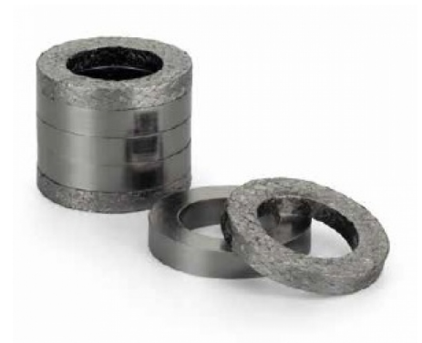
PGT4 GR8622 ESP